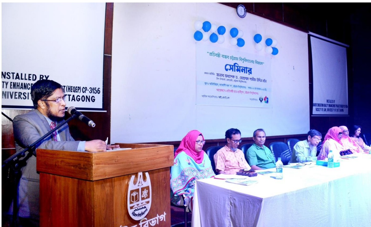
Photo: The discussion meeting to mainstream the disable students studying at the University.