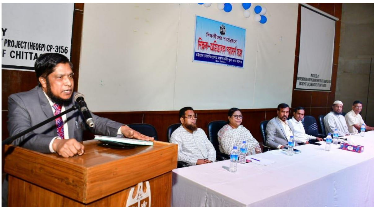
Photo: Guardian-Teacher meeting at the Chittagong University Laboratory School

The departments and faculties of the university engaged with different local and international partners to create higher education opportunities for graduates abroad. Recently, the US Embassy helped organize an event to educate students and faculty members on exchange and higher studies opportunities in the USA. Under a collaboration with the USAID's compass program, two students visited the University of New Hampshire, USA, and one faculty member got a fellowship for her MS at the same university. Like every year, ten female students from different departments of the University visited Nara Women's University in Japan for a one-week-long exchange program.