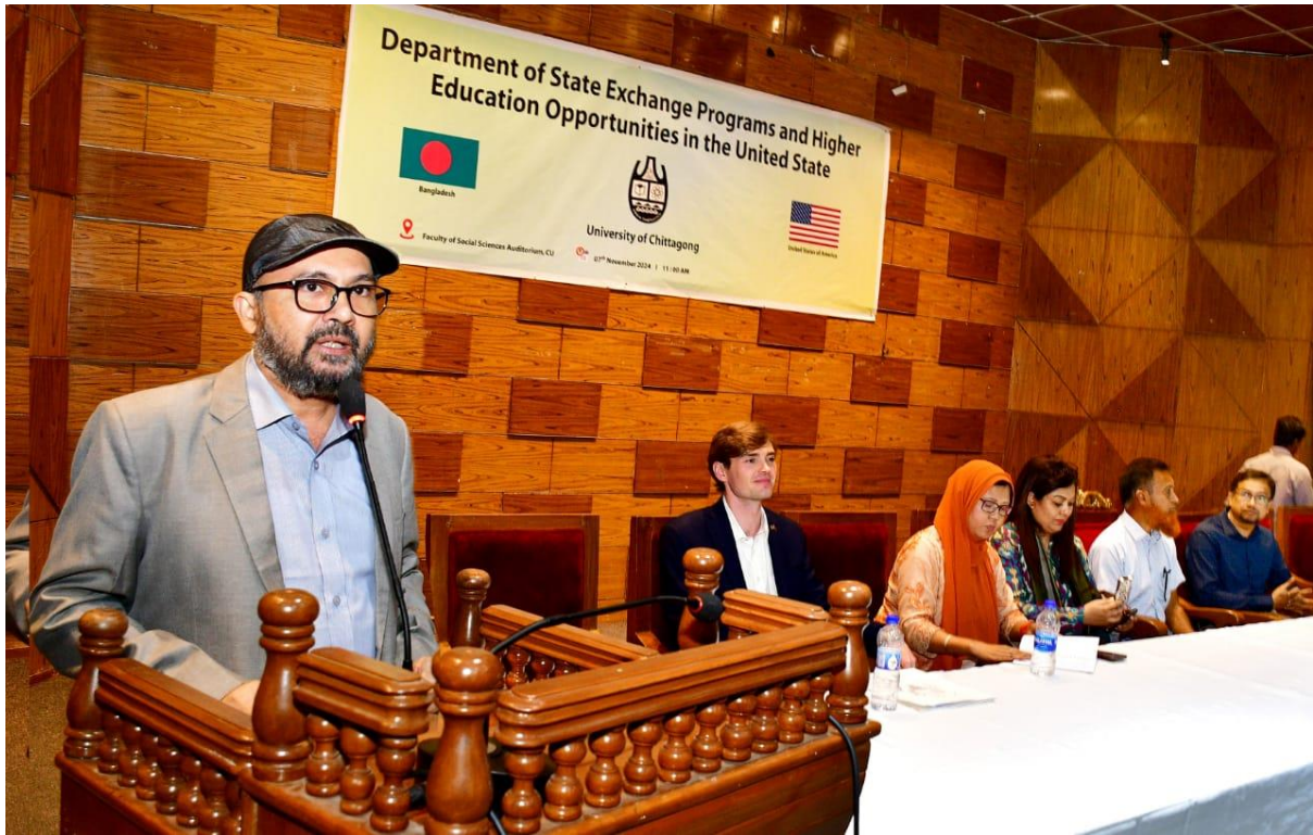
Photo: The seminar on opportunities for the exchange program and higher studies in the USA was organized with support from the Embassy.